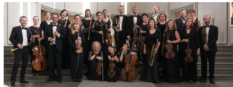
Hallgrímskirkja International Baroque Orchestra

MONDAY 30th DEC. at 8 pm NEW YEARS EVE DEC. 31st at 4 pm